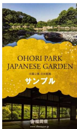
Group admission ticket(business card size) front back

Ticketed visitors can re-enter the garden by showing their tickets.